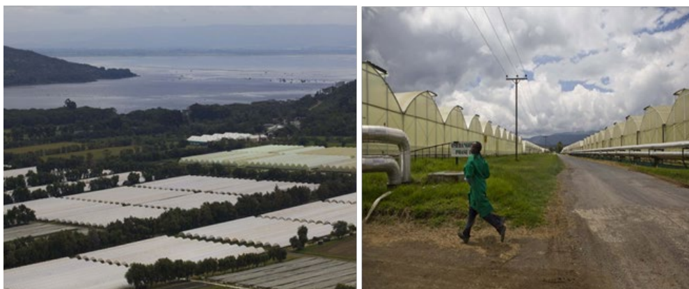
Figure 4. Aerial view of greenhouse horticulture farms (left) and one of the flower farm greenhouses around Lake Naivasha (right), inside greenhouse (Inset).