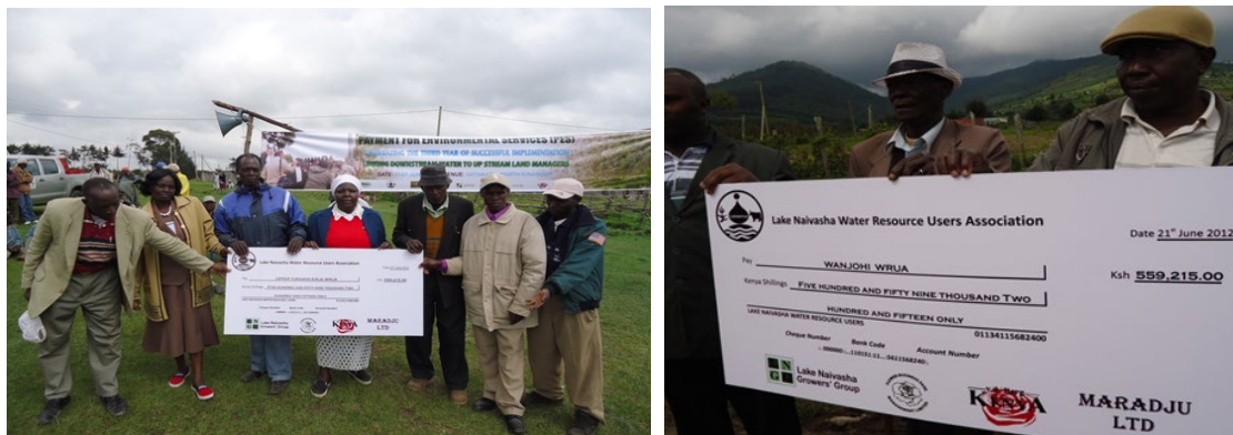
Figure 5. Members of Upper TurashaKinja (left) and Wanjohi WRUAs (right display their dummy cheque during annual payment event by buyers of ecosystem services. Photo: Nyongesa, 2012.

important to consider in PES scheme design to improve adoption of PES practices among farmers to restore degraded farms and increase productivity. Based on findings, this study recommends for increased awareness creation and training on benefits of PES concept among farmers and increase involvement of private sector as buyers of ecosystem services. This will enable farmers make informed choices for PES farm practices with positive attributes on agro-ecosystems restoration and farmer's socio-economic needs as incentives for practice adoption and sustainability. The adopted practices restore farm productivity and improve production of other ecosystem services including water flow to support commercial investment downstream. Promotion of PES scheme is recommended to strengthen the mutual business linkage between smallholder farmers upstream and the private sector downstream as sellers and buyers of ecosystem services, respectively. The payment provides additional income to households and is an incentive to smallholders to sustain the PES interventions for watershed management. The study further recommends for integration of PES concept in agriculture extension sector to ensure more farmers participate to improve their farm productivity, food security, income generation and conserve landscapes on scale. This study propose the need for the government to institutionalize PES as national natural resource policy to enhance