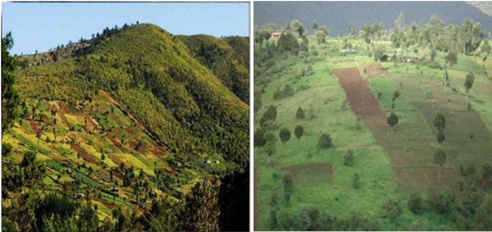
Figure 2. Smallholder farms on steep slopes in the upper catchment.