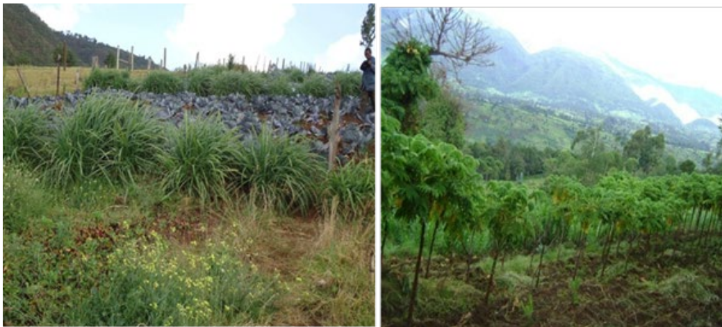
Figure 3. Two smallholder farms under PES conservation grass strips and agroforestry interventions along contours in the Upper catchment.